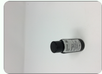
The photos on this report are of a sample collected by the lab and may vary from the final packaging.